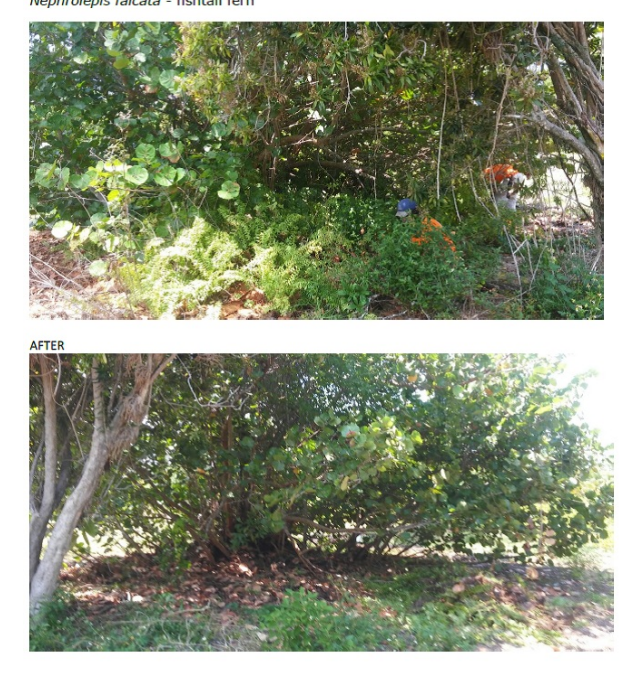
IRC's field crew members successfully remove Nephrolepis falcata (fishtail fern).

BEFORE Nephrolepis falcata - fishtail fern